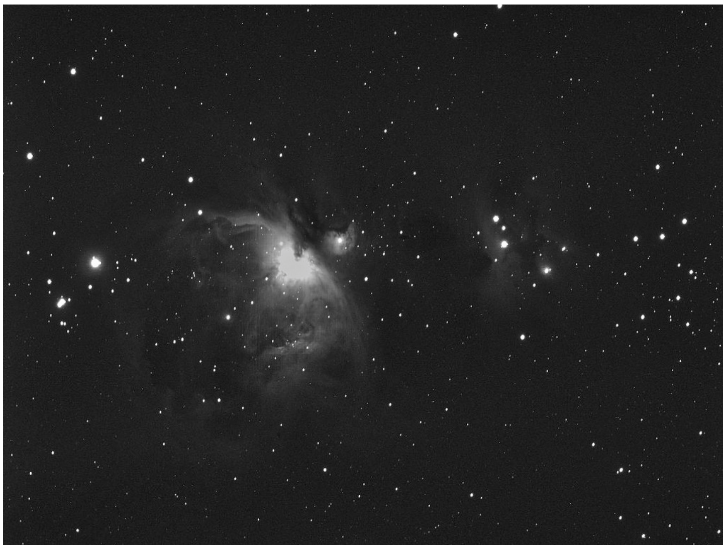
The Orion Nebula, Messier 42/43